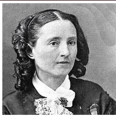
Photos: Coin to be released June 3, 2024 (top) Dr. Mary Edwards Walker Medal of Honor Recipient